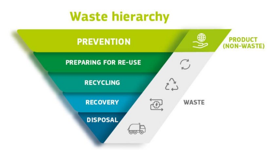
Figure 1: Waste hierarchy in the EU Waste Framework Directive