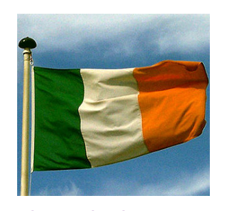
The Irish Flag

Meagher was arrested and sent to Tasmania, an island off the coast of Australia. At the time, prisoners were sent to faraway places such as Australia and America, never to return or see their families again.