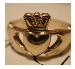
Claddagh ring

Tradition says that if the ring is worn on the right hand with the heart facing out, then the person wearing it is looking for love. However, if it is worn with the heart facing in, then the wearer has already found love.